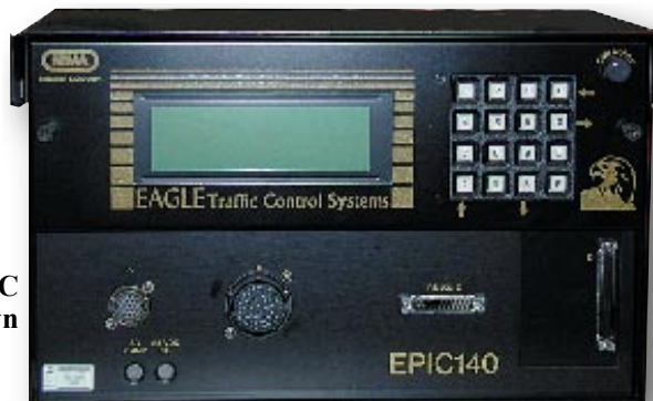
Model EPIC 140M01 Shown

The EPIC Series Controller is an Interval Oriented Pretimed Traffic Controller Unit with a full complement of operational, programming, and diagnostic capabilities. The EPIC Series Controller provides a Standard English Language Operator Interface improving efficiency and reducing errors. With internal historical data and full flexibility without the addition of hardware, the EPIC140 Series is a fully capable, user-friendly controller.