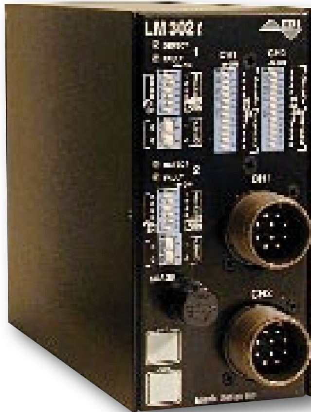
2-Channel Shelf-Mount Type Shown

Options: Optically Isolated Solid State Outputs Delay and Extension Timing